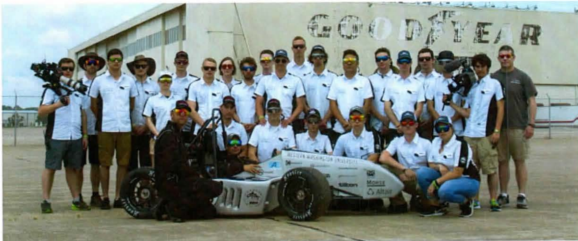
Team Photo from 2018 Lincoln Nebraska Competition